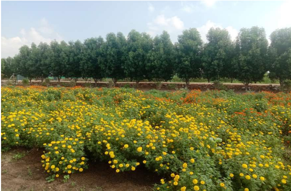
Plantation at Mines office complex

Six Monthly Compliance Report –October 2021 to March 2022