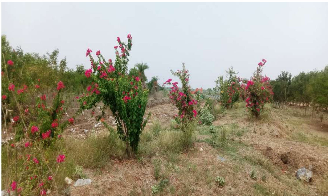
Plantation in Mine lease &amp; along the lease boundary