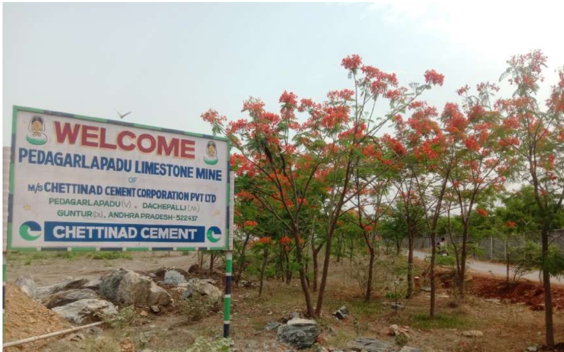
Plantation in Mine lease &amp; along the lease boundary